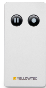
3 hush+ OnAir Controller YT3902 control over on air light signals with high-end PreAmp and mute size 185 x 128 x 41mm weight 1.1 lbs net approx. (0.5kg)