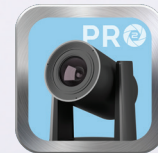
PTZ Control Pro 2

Click here to see our full list of Integration Partners