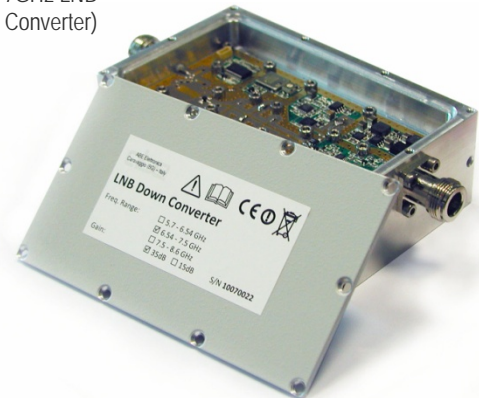
7GHz LNB (Low Noise Block Down Converter)