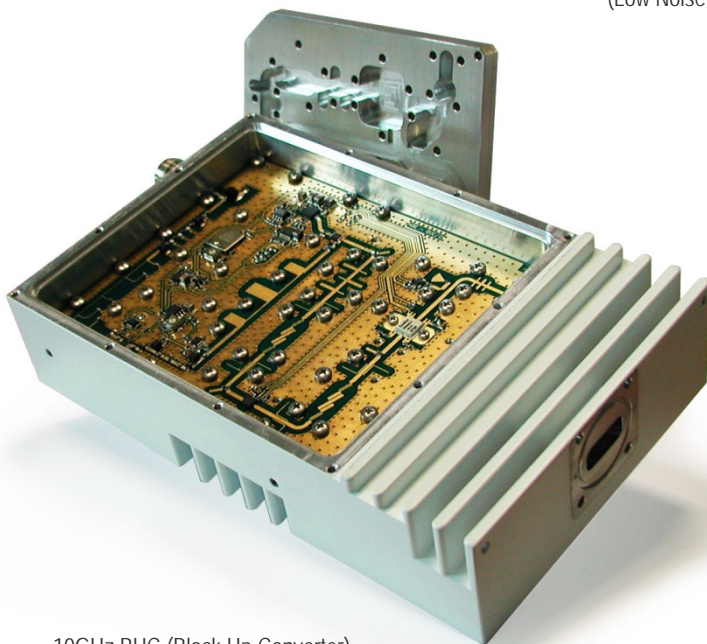
10GHz BUC (Block Up Converter)